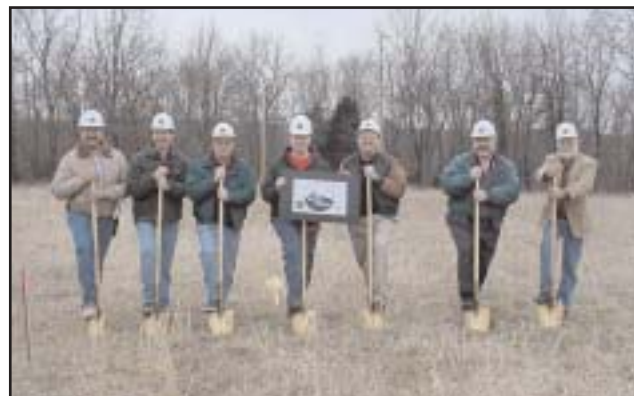
Groundbreaking at Heavenview Observatory. CASE members and New Life Ranch staff are involved!