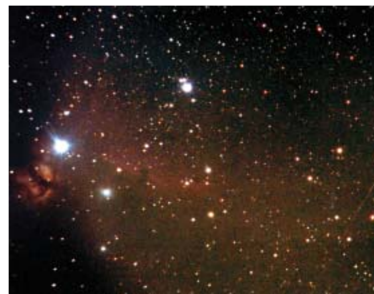
Horsehead Nebulae