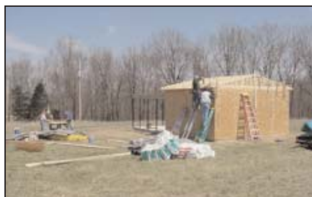
Members of the S.O.W.E.R.S. are busy building the observatory at NLR.