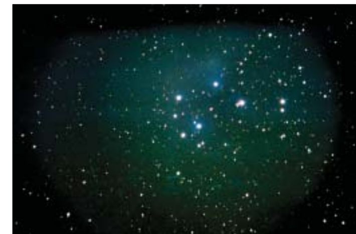
M45