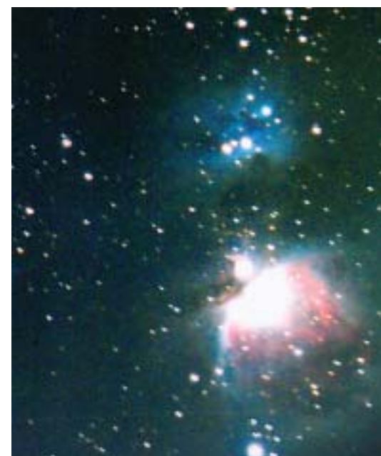
M42 by Patrick Carr

This area is reserved for photographs, drawings and musings from our membership. If you have an interesting thought, please be sure to e-mail it to thecarrs@tcac.net or by mail to the CASE office. If you have photographs or slides of interesting objects in astronomy, please get them to the CASE office for inclusion in our quarterly publication.